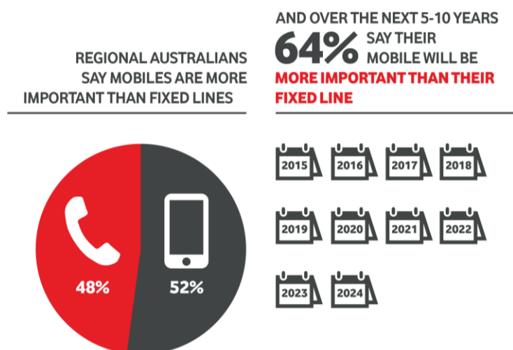
Figure 1 – Regional attitudes to mobiles v

Mobile services are now considered by many Australians to be their primary avenue of access to broadband and telephony services. Since the launch of 3G HSPA, HSPA+ and 4G LTE data services, mobile has become a reliable and fast mechanism to deliver broadband for many people in regional Australia.