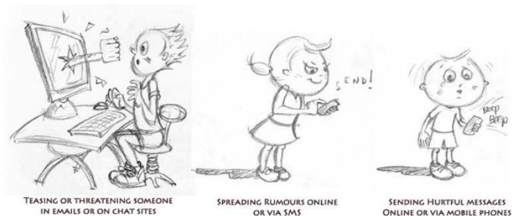
Figure 1 Joint Select Committee on Cyber-Safety 2011 study graphic definitions

In the survey for children aged 13 years and older, cyberbullying was not defined, rather, a series of questions were posed relating to behaviours (pp 551–552):